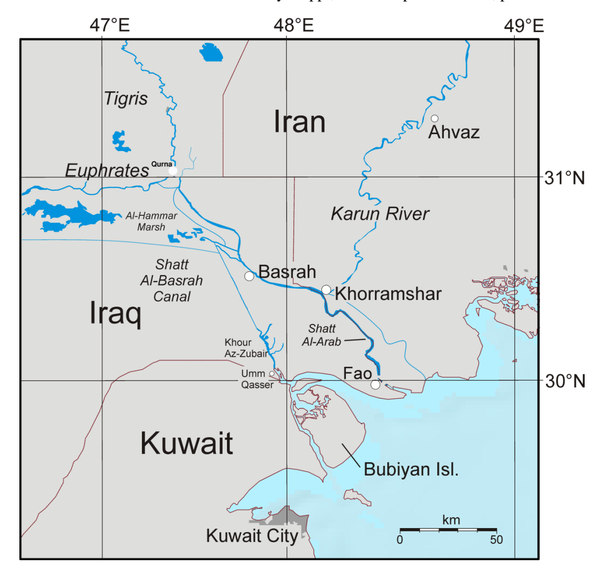
Fig. 1. Sampling site from Fao region

Twelve specimens of E. integrifrons were recently collected from NW of the Persian – Arabian Gulf, Fao region (Fig. 1) on February 2010. The specimens were obtained with prawn trammel nets over muddy bottoms. Specimens are preserved in 70% alcohol and deposited in the marine science centre (MSC) (collection number: 32). The main abiotic parameters in the study area by the time of collection were as follows: salinity 38 ppt, water temperature 12 C, pH 8.19.